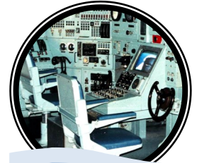
1. Ship Control Panel

Sergeant _____ of Lyme, CT was chosen to operate Bushnell's Turtle during its attack on the British fleet. By being the first submariner to launch an attack against an enemy using an experimental vessel and experimental weapons he demonstrated the value of being _____