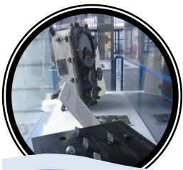
2. Harman Automatic Steerman Device

W elcome. During your journey through the museum this scavenger hunt will help you learn how the 12 values found in the Scout Law tie into the history and heritage of the U.S. Navy Submarine Force. For each object fill in the blank with information found in the exhibits and write in what value is best represented. (Hint: Each is only used once)