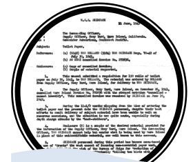
9. USS Skipjack Memo

The crews of the _____ and the _____ played the world’s first polar _____ game and greeted Santa Claus. By having fun, visiting each other and the North Pole’s most famous citizen, these crews demonstrated the value of being _____