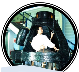
6. Bushnell's Turtle