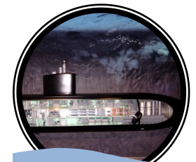
11. City Beneath the Sea

This black and white doll was used as a simple _____ by the crew of the Seafox. By assisting the crew in this way we can see that even a doll can demonstrate the value of being _____