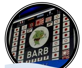
5. USS Barb Battle Flag