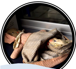
10. Black and White Doll