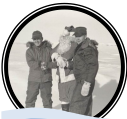
8. Greetings from the North Pole

Choose the object, story or person you learned about in the museum that you think best represents the Boy Scout Motto, “Be Prepared”, and explain why you think so here: