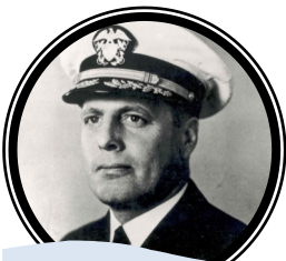
4. CAPT John Philip Cromwell

This device was more _____ than the Sperry Company's autopilot. So by adopting it the Navy demonstrated the value of being _____